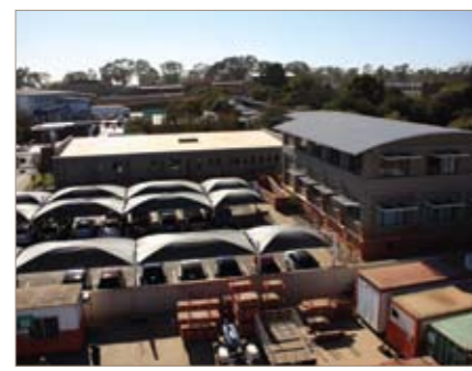
CIVCON Head Office, Clayville Gauteng