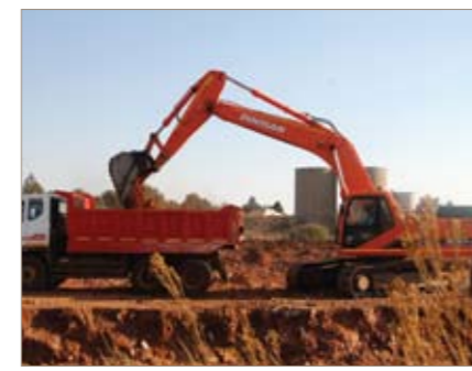
New plant 2008

"The only place where success comes before work is a dictionary." - Vidal Sassoon 1928