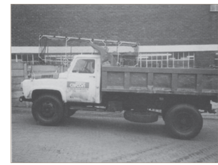
"Old Faithful" 1981 Nissan Tipper