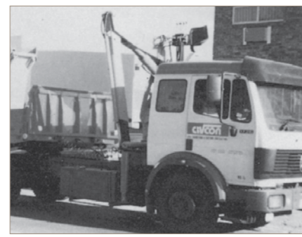
New Semi-trailer 1998