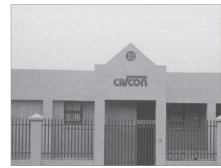
Old Head Office, Industria North