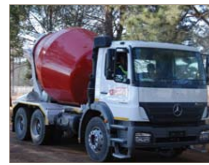
New plant 2008